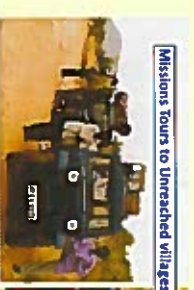
Missions Tours to Unreached villages and people - Warangal, Kammpar DT