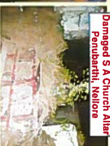
Damaged S A Church Altar Penubarthi, Nellore