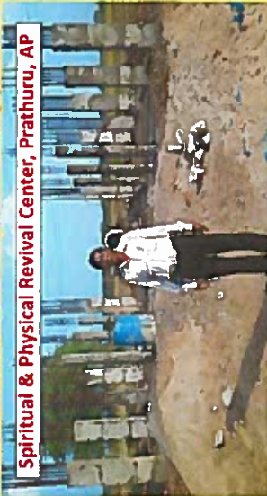
Spiritual & Physical Revival Center, Prathuru, AP