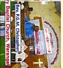
Reformation & Revival, Centenary Baptist Church, Warangal

WITNESS: Helping the churches to be a powerful witness in the world by carrying His cross, bearing shame and suffering for the Gospel of Christ and to help them to reflect the Light of Christ's character, His compassion and Holiness.