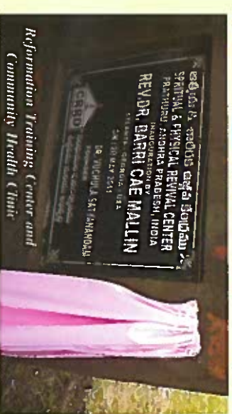
Reformation Training Center and Community Health Clinic