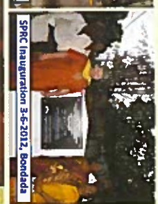
SPRC Inauguration 3-6-2012, Bondada