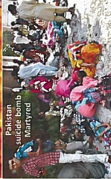
Pakistan suicide bomb Martyred

“Is it time for you yourselves to dwell in your paneled houses, and this temple to lie in ruins?” Haggai 1:4