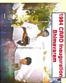
1984 CRRD Inauguration Bhimavaram

PRAYER: Collecting the details of the Churches and their condition in order to pray earnestly about the churches problems and needs, raising prayer partners to organize prayer cells to support the churches with prayer to pull down the strong holds of satanic forces.