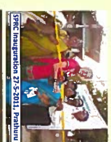
SPRC Inauguration 27-5-2011, Pashuru

DEVELOPMENT: Improving the spiritual, social and financial standards in the families of the churches with Christ love through community developmental activities with mutual help and cooperation.