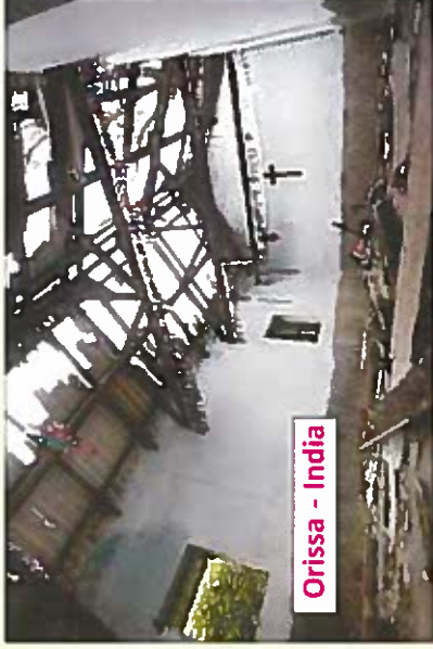
Orissa - India