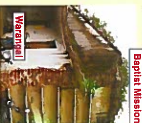
Baptist Mission - Christian Hospitals Warangal